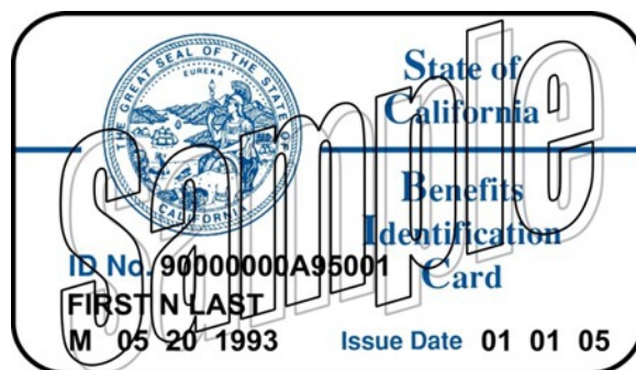
BIC Pre-Poppy Design: